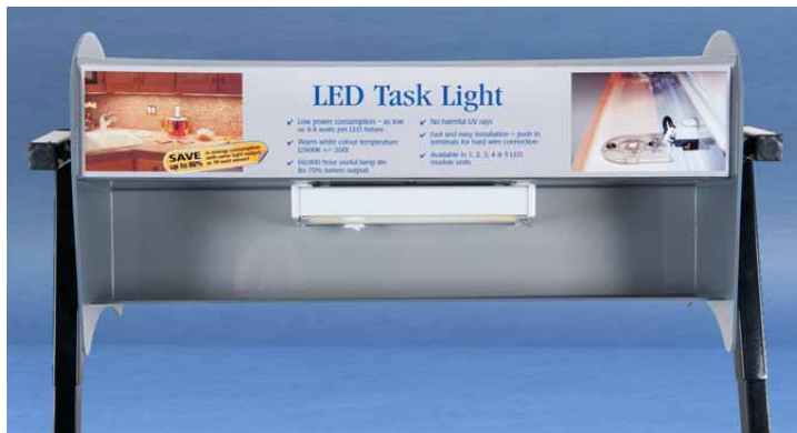
Actual extension display may vary from image shown.