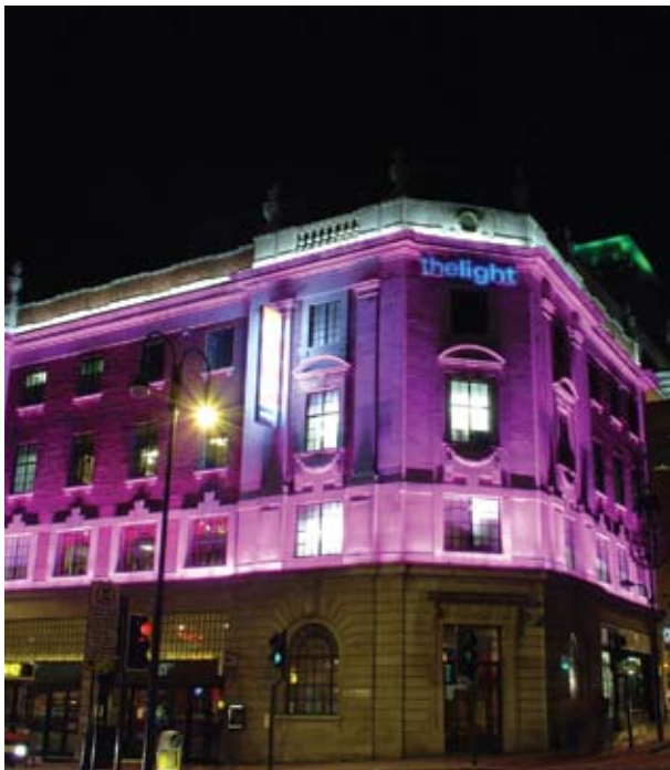
The Light Shopping Centre, Leeds. Thanks to Arup Lighting.